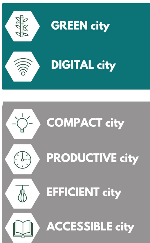
Picture 1: Priorities of the Polish National Urban Policy 2030.

The NUP 2030 recognises the aim for an integrated approach, providing clear rules and guidelines to fulfil such integration. A case in point is the greening rule, underscoring that any green initiative should incorporate digital aspects to strengthen synergies between these two. The emphasis on integration extends to other rules related to accessibility, participation, cooperation, urban policy creation, and