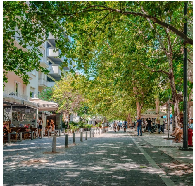
Picture 6: Trees in Athen's public space . Photo credits: Municipality of Athens