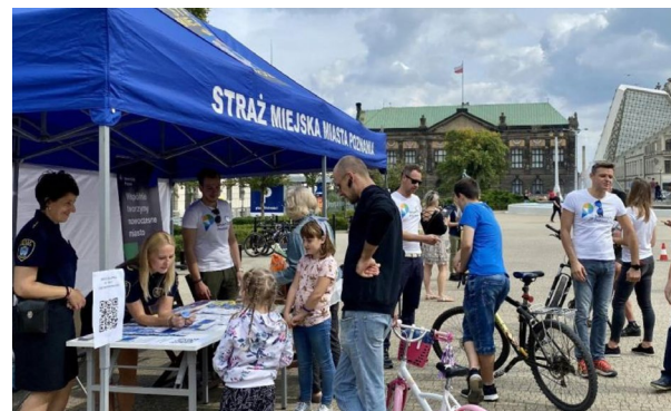
Picture 4: Educating Poznan inhabitants on micromobility.